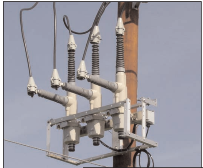
Viper-ST recloser with SEL 651R control.

After investigating the latest technology in automation, the utility selected G&W's pre-engineered Lazer solution utilizing G&W Viper-ST reclosers with Schweitzer Engineering, model SEL 651R, controls and one SEL 3351 central processor. The 3351 was used to automatically reconfigure the recloser controls as needed to maximize the efficiency of isolating a faulted section.